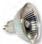
MR16 Halogen lamp