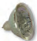
MR16 Two-pin 18LEDs Bulb