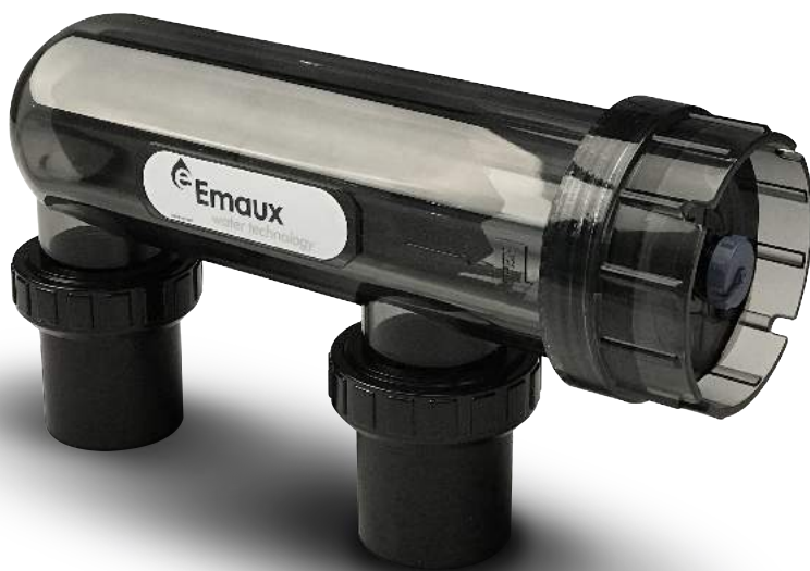
Titanium cell with 2 meters cable

Salt chlorinated pools are among the best to enjoy a comfortable bath, but such systems tend to raise pH. With SSCone you get the right solution: its automatic dosing pump injects acid to achieve the proper pH balance, obtaining the most efficient chlorine generated by the Emaux cell. No harmful by-products. It is programmed automatically.