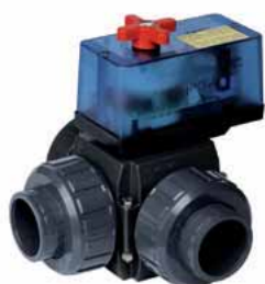
Three-way motor ball valve